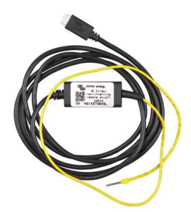
VE.Direct non inverting remote on-off cable

Minimum input voltage needed for switch on: approximately 6V Switch off level: input voltage must be less than 1V or must be free floating